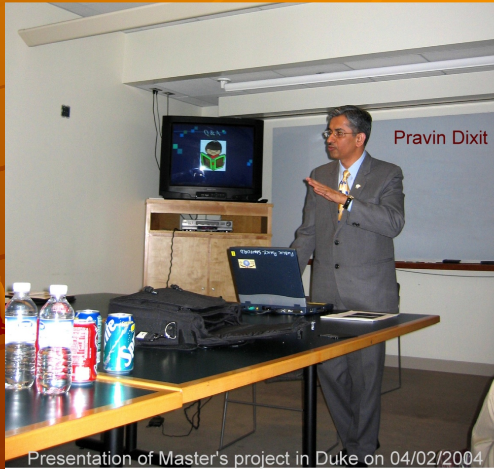
Presentation of Master's project in Duke on 04/02/2004